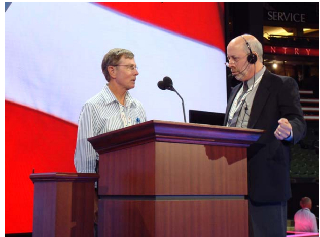
Rehearsing on the big stage