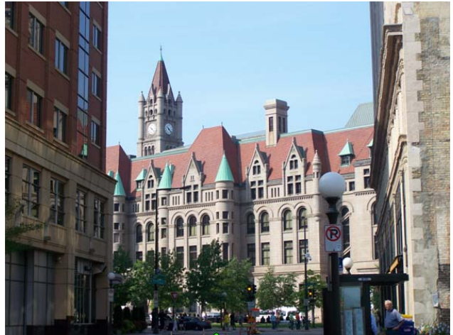
The Landmark Center, location of NACo reception